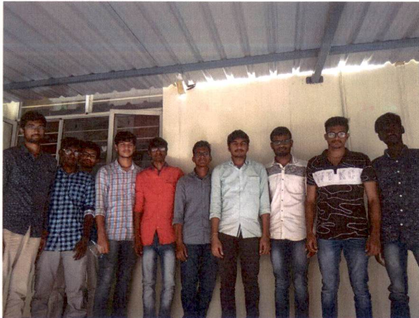
Convener Hostel Committee Cell CMRCET